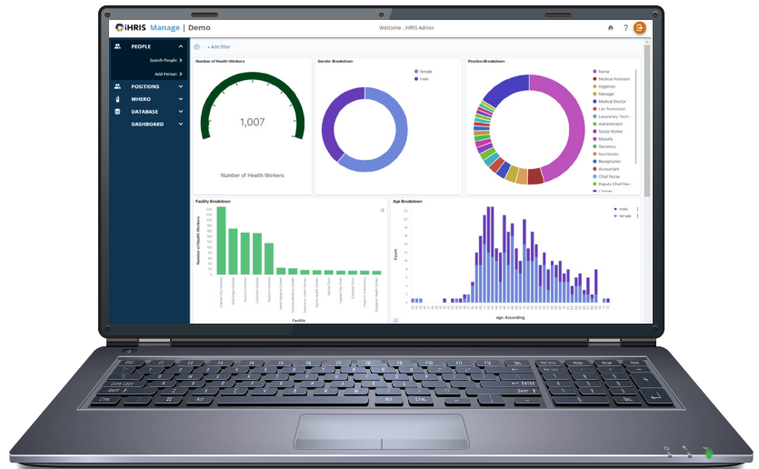
iHRIS desktop user interface

To prepare for pandemics and provide high-quality health care every day, you need data. iHRIS gives them to you. Track, manage, and visualize your health workforce data with iHRIS.