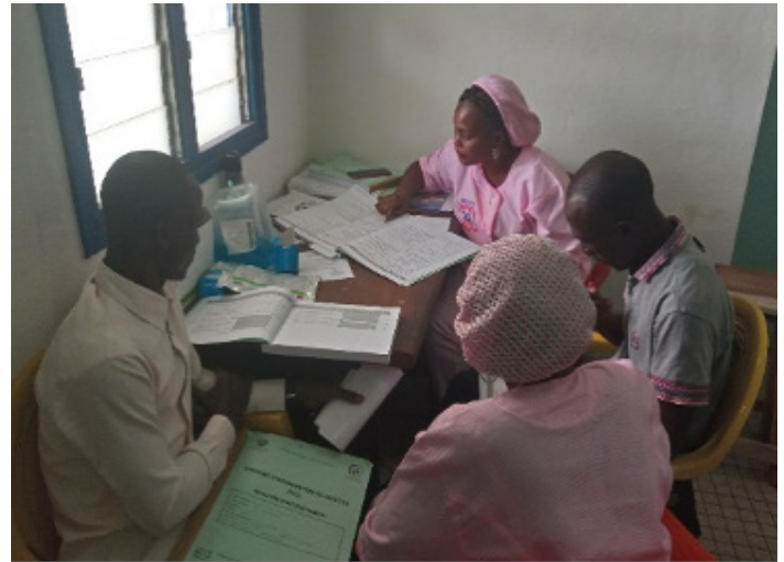
At Agnibilekro General Hospital in Côte d’Ivoire, midwives and district statistics officers examine registers during a data quality control visit.

and effectiveness. Sustainability, replication, and scale-up are essential elements of the model, rooted in local ownership and buy-in at all levels of the health system.